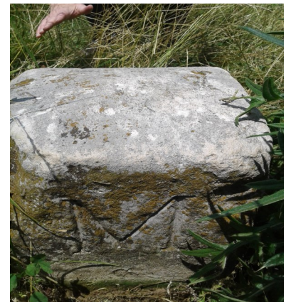
The Maryland side—"M"