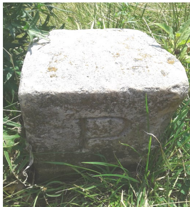
The Pennsylvania side—"P"