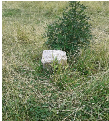
Marker Number 85