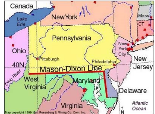
The Mason-Dixon Line established borders between multiple states