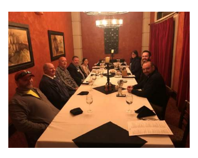
PW Peers Lunch with new members from January