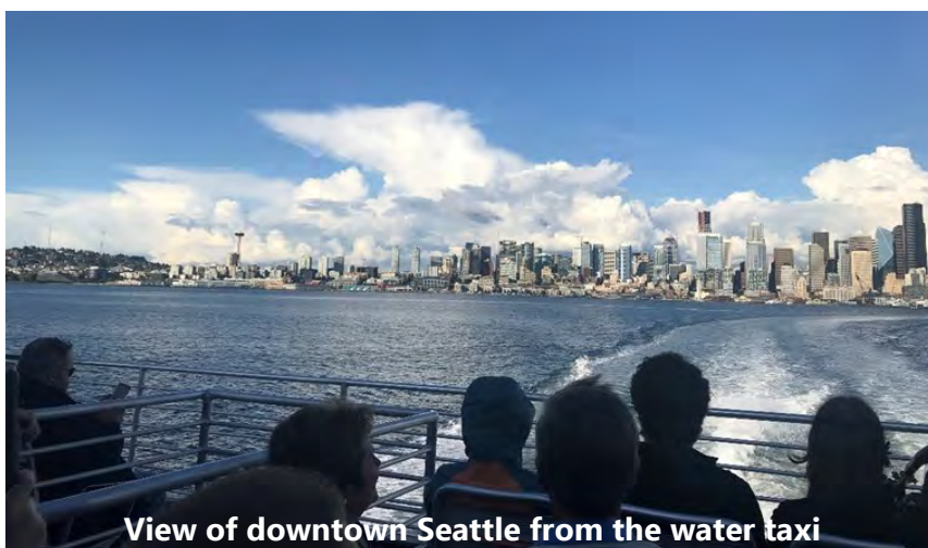
View of downtown Seattle from the water taxi