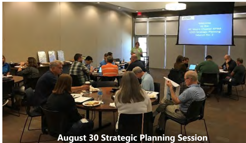
August 30 Strategic Planning Session

As we continue with the process, it's very important that we gather as much input from our members as possible. Please email me ( DLBrown@walterpmoore.com ) with responses to the following questions centered on APWA National's four Strategic Goals: