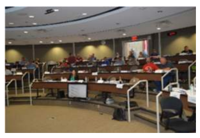
The Lenexa Fire Training Center was an excellent site for the Fall 2019 Public Works Institute