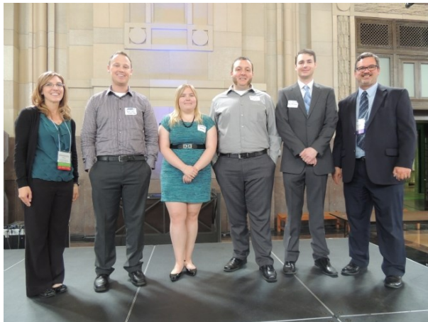
2012-2013 MDC scholarship recipients and chapter representatives.

The scholarship application will be available in early March. If you are interested in applying for this scholarship or know of a scholar who may be interested be on the look-out for the application and be ready to apply.