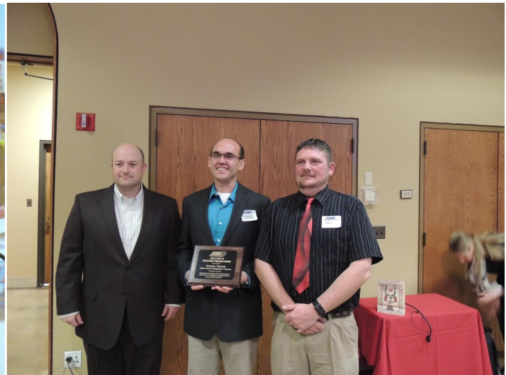
Excellence in Operations Program Award—City of Lenexa