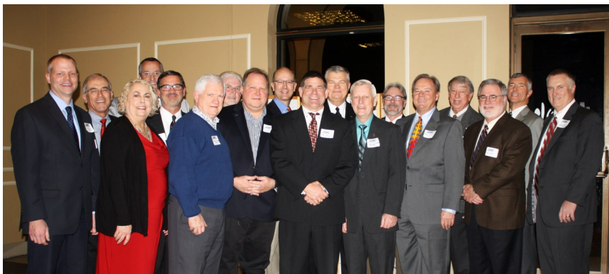
APWA KC Metro Chapter Past Presidents