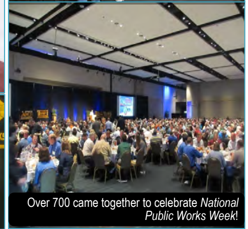
Over 700 came together to celebrate National Public Works Week!