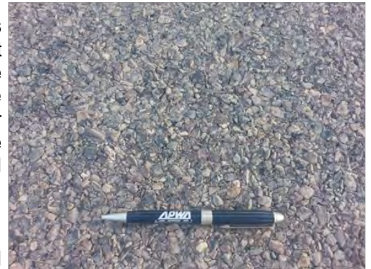
Figure 1 - 2014 chip seal - after one sweeping

We've now used two imported aggregate sources. Last year we used uncoated chips from Granite Mountain quarries in Arkansas. This was manufactured as a component for the ultrathin bonded asphaltic surface treatments (UBAS) placed by the two state DOTs and by several other local agencies. This year, given the quantity needed, we were able to specify a more desirable (coarser) gradation and the low bidders for our two projects both proposed material from Iron Mountain quarries near St. Louis. The photo is just north of City Hall and shows a 2 day old surface prior to it's second and final sweeping.