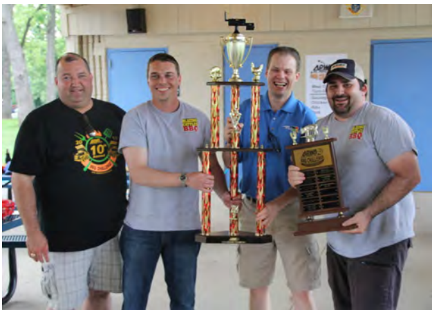
Grand Champions – Blazing Cattles BBQ Team sponsored by Walter P. Moore