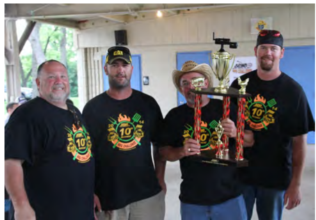
Reserve Grand Champions – Up In Smoke Team sponsored by City of Olathe