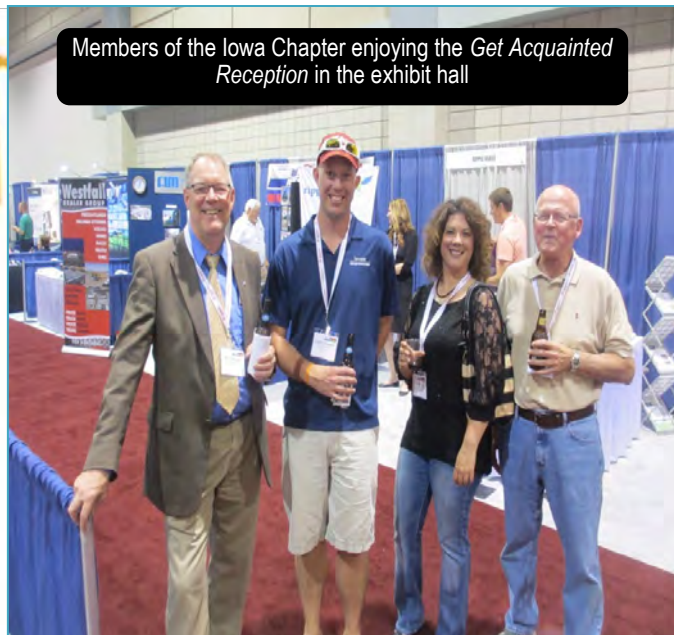
Members of the Iowa Chapter enjoying the Get Acquainted Reception in the exhibit hall