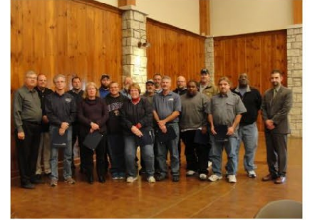
Sixteen attendees at this Public Works Institute have completed all four PWI modules and will be honored at the KC Metro APWA Chapter's Holiday Party as Public Works Institute graduates