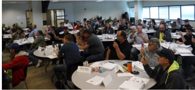
Photo from Module I, Spring 2018

This is an advance announcement that the next module of the KC Metro Chapter's training for public works supervisors and managers "Public Works Supervision Skills" has been scheduled for October 23-25, 2018 in the 2nd Floor Ballroom of the Memorial Hall in downtown Kansas City, KS – 600 N. 7th Street Trafficway, Kansas City, KS 66101.