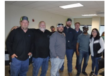
Networking is always important at the PWI as the attendees from Olathe demonstrated