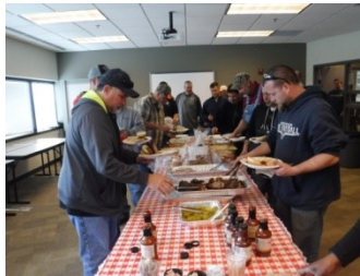
Things got serious when lunch time came, Parmesan Chicken on day one, Pizza on day two and Jack Stack BBQ on day 3