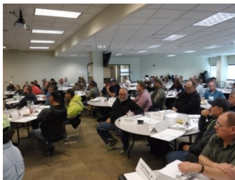
Eighty-seven attentive Public Works Institute attendees listened to the first morning's presentation and enjoyed the Raytown Education Conference Center facility