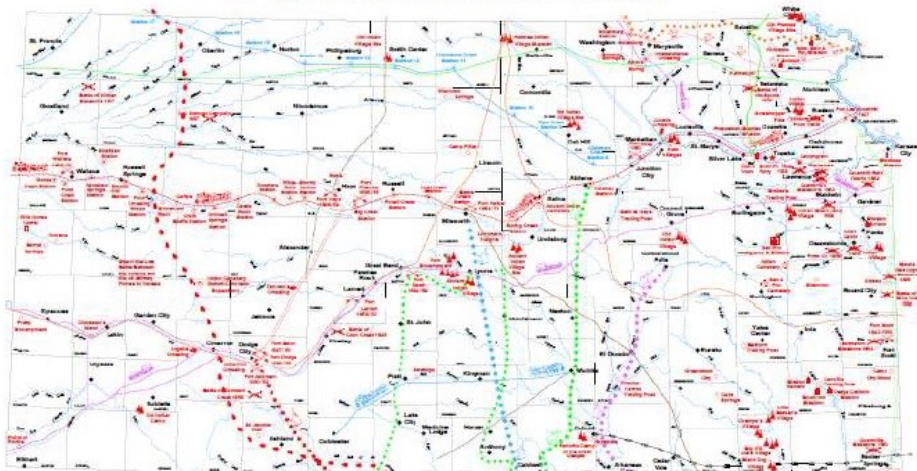
Indian trails, Santa Fe Trail, Oregon Trail, etc.

While Kansas had a large number of open, public roads, the original State Constitution prohibited the state from building roads or other internal improvements. Roads and other public infrastructure improvements were considered a local matter as the constitution said that, “the state shall never be a party to carrying on any works of internal improvement.”