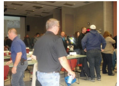
The line formed quickly when Jack Stack BBQ was served for lunch the last day!