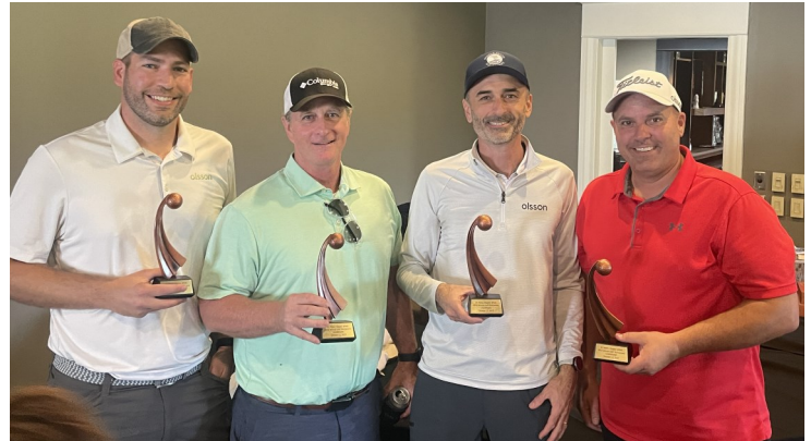
Olsson were the first place winners for the team competition.

The tournament included 6 hole prizes and a putting contest. Those winners were: