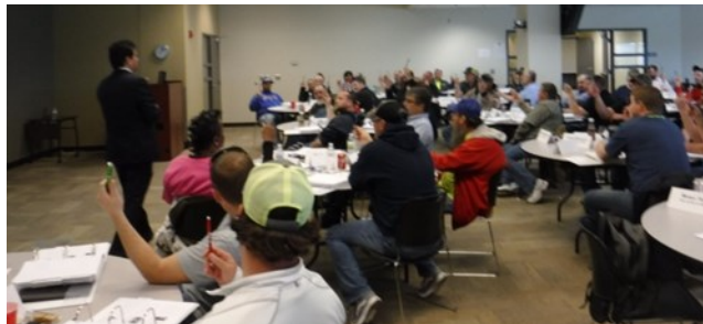
Photo from Module I, Spring 2018

This fall's Public Works Institute "Public Works Supervision Skills" has been scheduled for October 23-25, 2018 in the 2nd Floor Ballroom of the Memorial Hall in downtown Kansas City, KS – 600 N. 7th Street Trafficway, Kansas City, KS 66101.