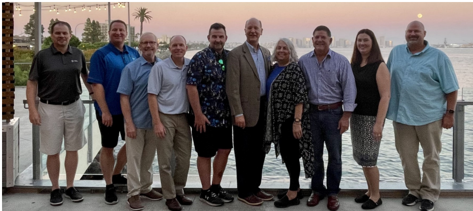
Pictured: KC Metro Chapter Past Presidents (above), KC Metro Chapter 2023 Executive Committee (bottom left), and KC Metro Chapter Past National Top 10 Winners (bottom right)